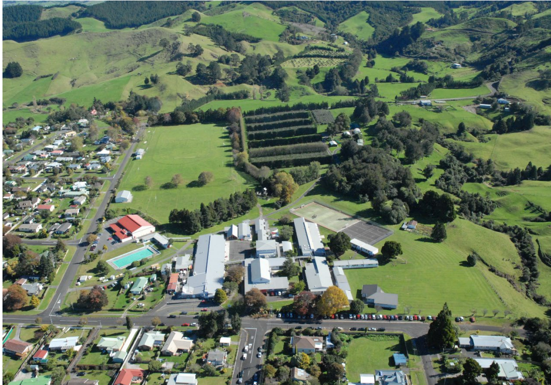
Waihi College Aerial View

Connecting Families | Sharing Cultures | Improving Learning