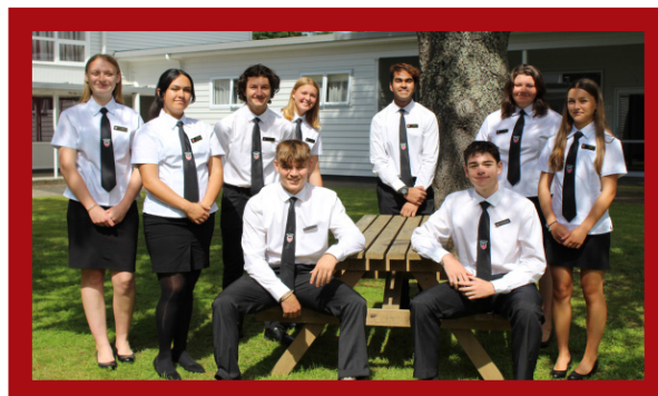
Our Student Leaders for 2023

“The great thing about Waihi College is how the tight knit relationships between students and staff mean there is a sense of community and belonging within our school.”