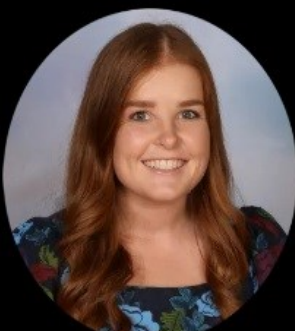
Paige Kingston Visual Art