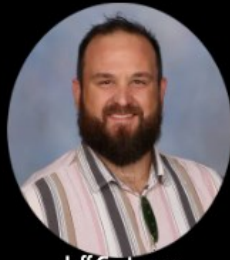
Jeff Cochrane Digital