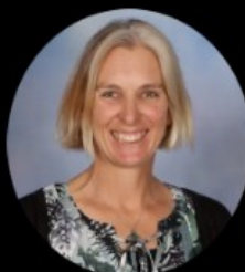
Kate Morley Senior Hub