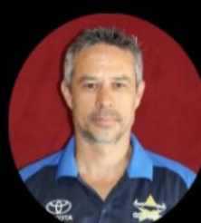
Michael McManemin Senior Hub