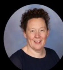
Jo Howell Senior Hub