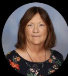
Carolyn Graveson Senior Hub